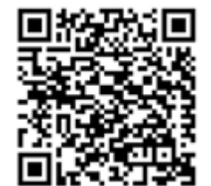
Scan QR Code for the complete Agenda